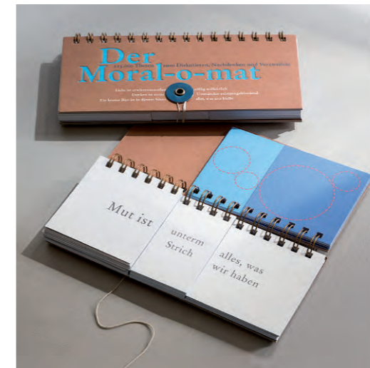
Moral-o-mat! Theses for discussing, pondering and doubt!