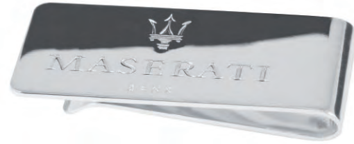
Money clip, 925 silver or silver-plated, approximately 6 cm long. Price upon request.