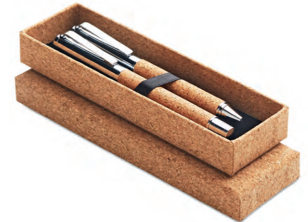
Ballpoint pen set made of cork and metal, consisting of a twist-action ballpoint pen (blue ink) and a rollerball pen (black ink) with a cork shaft. Delivered in a matching cork box. Print size depends on the printing method: laser engraving, screen or pad printing. Price: € 8 each when purchasing 50 pieces.