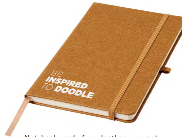
Notebook made from leather remnants A5 format, cover with imprint, an elastic band, a pen loop, a bookmark, and 80 sheets of lined paper. Your logo can be applied through embossing, screen printing, or pad printing. Price: € 4 each when purchasing 50 pieces.