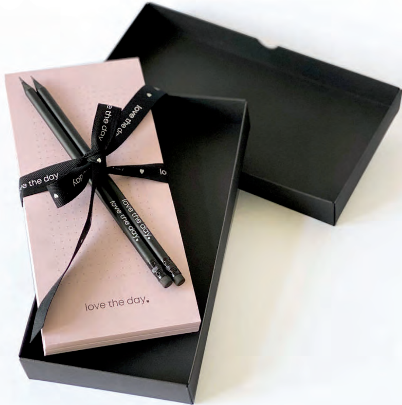
Pencil set from Love the day (from Munich). Detailed prices and further product suggestions from this line available upon request.