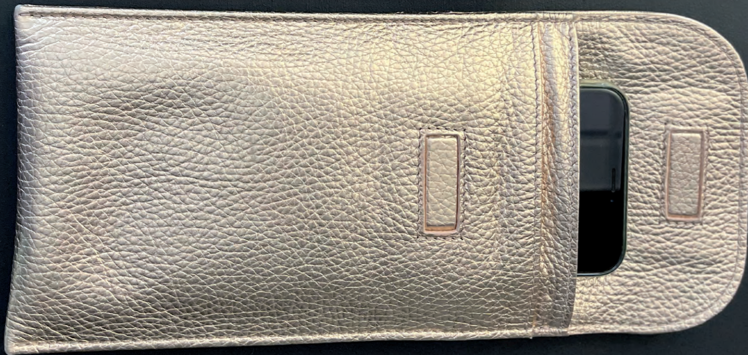
Image: front & back view of phone case