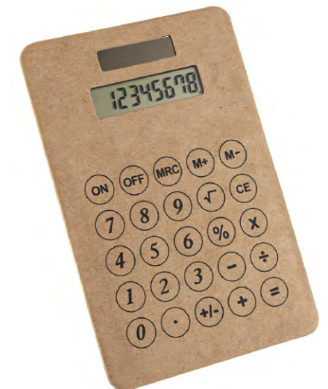
Environmentally sustainable calculator with a sturdy cardboard casing and solar cell operation, it's perfectly recyclable, and the 'green' promotional item is perfect for digital printing because you can personalize the calculator with your logo under the display (print size: 60 x 20 mm with screen printing) Price: € 4 each when purchasing 50 pieces.